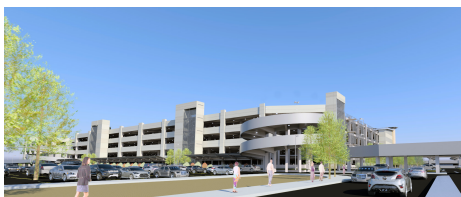
North elevation perspective rendering