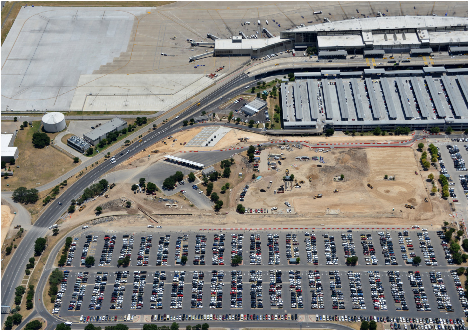
Southern view of the project